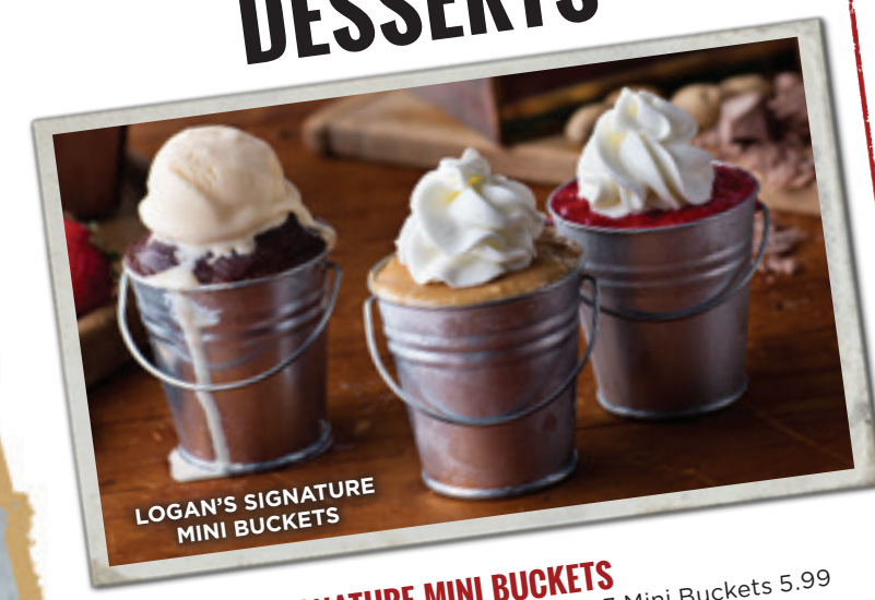
LOGAN'S SIGNATURE MINI BUCKETS

LOGAN'S SIGNATURE MINI BUCKETS Choose a flavor. Keep the bucket. Any 3 Mini Buckets 5.99 Chocolate Brownie 2.29 Nutter Butter® Fudgeslide 2.29 Mini Cheesecake 2.29